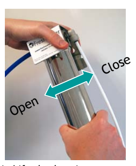
4. Lift the housing assembly off the retaining screws and holding the head firmly with one hand carefully unscrew the filter sump until it is free from the head. Empty the water from the filter sump and put the sump to one side.