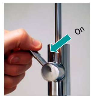
2. Turn on the dispenser tap to release the pressure in the system. Leave the tap in the 'on' position.

Important note. It the tap is not left `on' the pressure trapped in the system will make it impossible to unscrew the filter housing sump from the head.